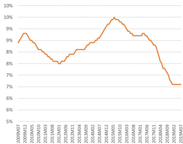
Table 33. Monthly unemployment rate trend, 2009–2019