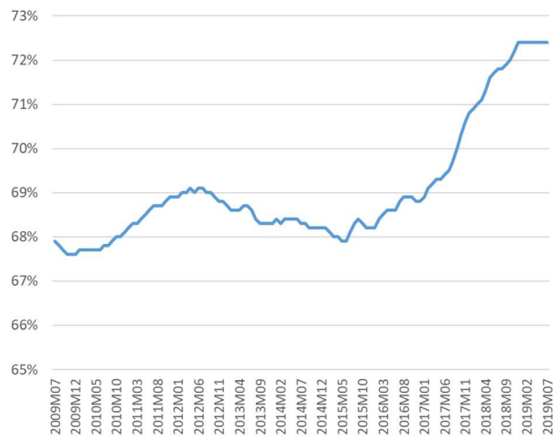
Table 32. Monthly employment rate trend, 2009–2019